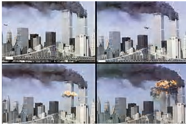
Impact of the second plane crashing into the South Tower of the World Trade Center in New York on 11th September 2001 at 09:03 EST (from top left to bottom right).